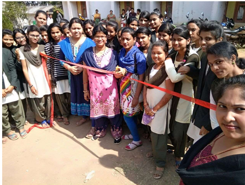
FIG:2. STUDENTS PRATICIPATE IN THE SPORTS