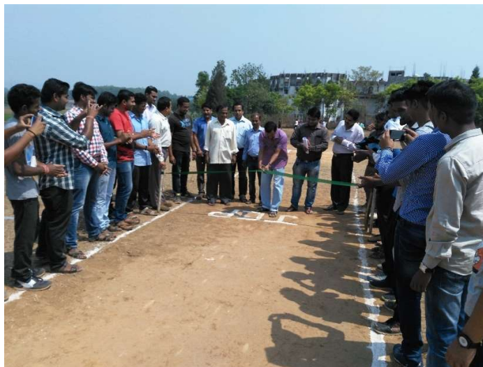
Fig:2. Principal Cutting the ribbon and start the sports activity

Physical Education is an integral part of the total education system. It helps in the attainment of the ultimate aim of education i.e. the achievement of holistic development. Games and Sports play a vital role in the student's life. A student should study hard to be successful in competitive examinations. But, he should also play games and sports to enjoy the health and vigor of life. Along with bookish learning, a student should spend his time on games and sports also. Either studying or working alone makes us exhausted. We remain no longer efficient to do any work. Sports remove our mental exhaustion. Education without sports is incomplete. The Department of Physical Education and Sports marks itself as one of the most efficacious. Jeypore College of Pharmacy, Jeypore held its annual sports meet-2018 from 29-01-2018 to 31-01-2018. It strives to excel at all levels and bring laurels to the college. With the help of college faculty, we are continuously improving in sports field, This venture shall enable the students and staff to have fun, learn new sports, enhance social interaction and tests one's physical capability. These competitions also offer a break from the daily routine tasks and recreate or re-energetic them.