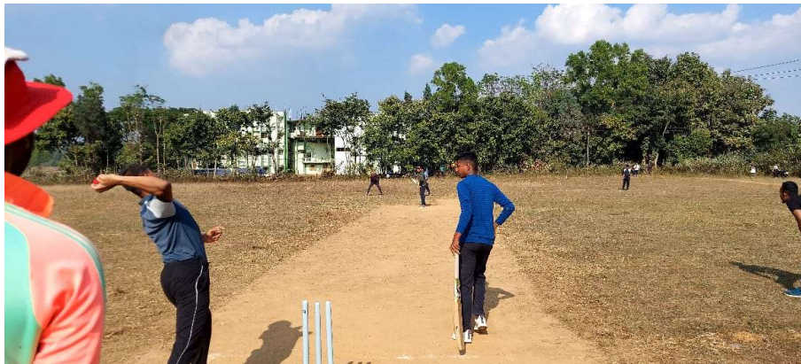
Fig:2.STUDENTS PARTICIPATE IN CRICKET