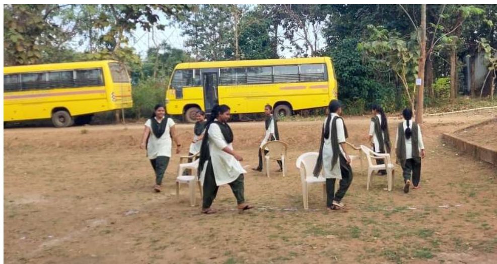
Fig:1.Students Participate in Musical chair comptitation

Physical Education is an integral part of the total education system. It helps in the attainment of the ultimate aim of education i.e., the achievement of holistic development. Games and Sports play a vital role in the student's life. A student should study hard to be successful in competitive examinations. But, he should also play games and sports to enjoy the health and vigor of life. Along with bookish learning, a student should spend his time on games and sports also. Either studying or working alone makes us exhausted. We remain no longer efficient to do any work. Sports remove our mental exhaustion. Education without sports is incomplete. The Department of Physical Education and Sports marks itself as one of the most efficacious. Jeypore College of Pharmacy, Jeypore held its annual sports meet-2020 from 13.03.2020 TO 14.03.2020. It strives to excel at all levels and bring laurels to the college. With the help of college faculty, we are continuously improving in the sports field, this venture shall enable the students and staff to have fun, learn new sports, enhance social interaction and tests one's physical capability. These competitions also offer a break from the daily routine tasks and recreate or re-energetic them.