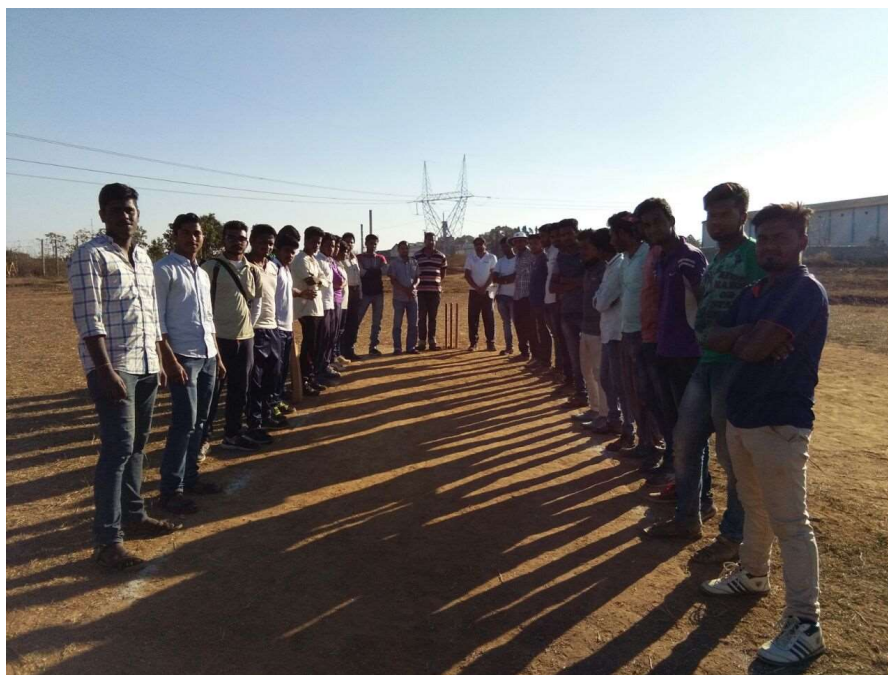
FIG:1. PLAYERS ARE PRATICIPATE IN THE GAME

Physical Education is an integral part of the total education system. It helps in the attainment of the ultimate aim of education i.e., the achievement of holistic development. Games and Sports play a vital role in the student's life. A student should study hard to be successful in competitive examinations. But, he should also play games and sports to enjoy the health and vigor of life. Along with bookish learning, a student should spend his time on games and sports also. Either studying or working alone makes us exhausted. We remain no longer efficient to do any work. Sports remove our mental exhaustion. Education without sports is incomplete. The Department of Physical Education and Sports marks itself as one of the most efficacious. Jeypore College of Pharmacy, Jeypore held its annual sports meet-2019 from 18.02.19 TO 20.02.19. It strives to excel at all levels and bring laurels to the college. With the help of college faculty, we are continuously improving in sports field, this venture shall enable the students and staff to have fun, learn new sports, enhance social interaction and tests one's physical capability. These competitions also offer a break from the daily routine tasks and recreate or re-energetic them.