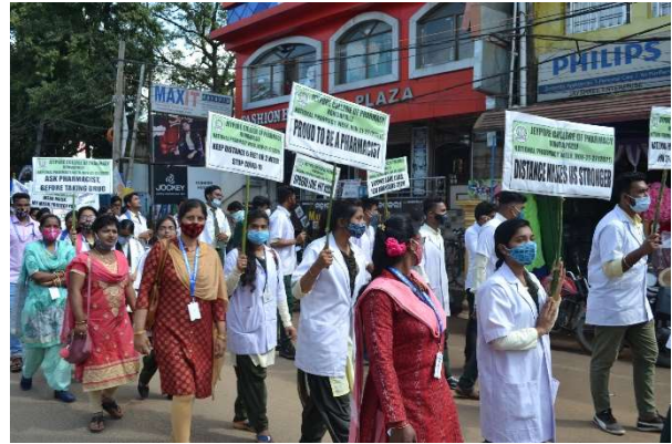
Fig. 1 & 2 Staff & Students Participating in the Educative Silent Pharma Rally