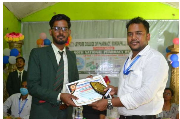
Fig. 11 & 12 Prize Distribution at Valedictory Function