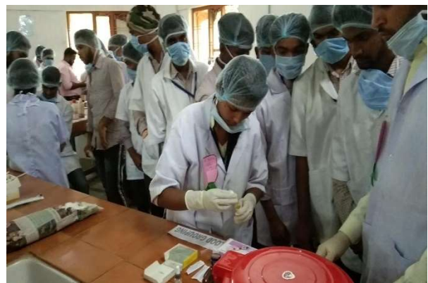
Fig. 3 & 4 12 th standard Students of nearby colleges demonstrated during Pharma-Expo