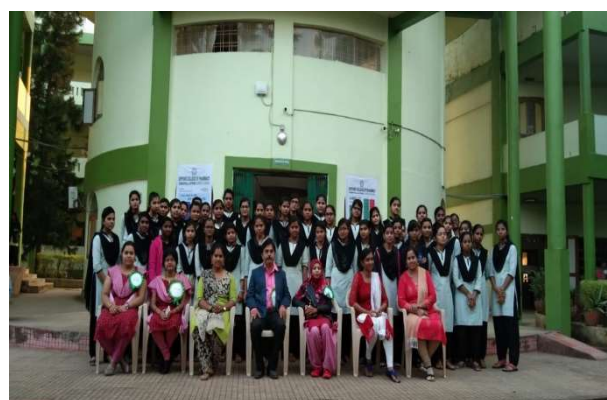
Fig. 5 & 6 12 th standard Students of nearby colleges attended Pharma-Expo