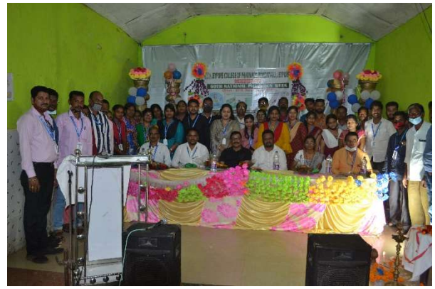
Fig. 9 & 10 Valedictory Function conducted at Jyoti Kalyan Mandap, Jeypore