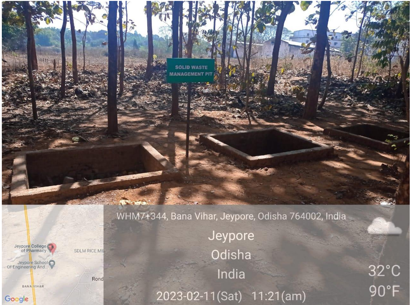
Fig-1 Solid waste Management PIT.

PRINCIPAL JEYPORE COLLEGE OF PHARMACY RONDAPALLI, JEYPORE (K) 764002