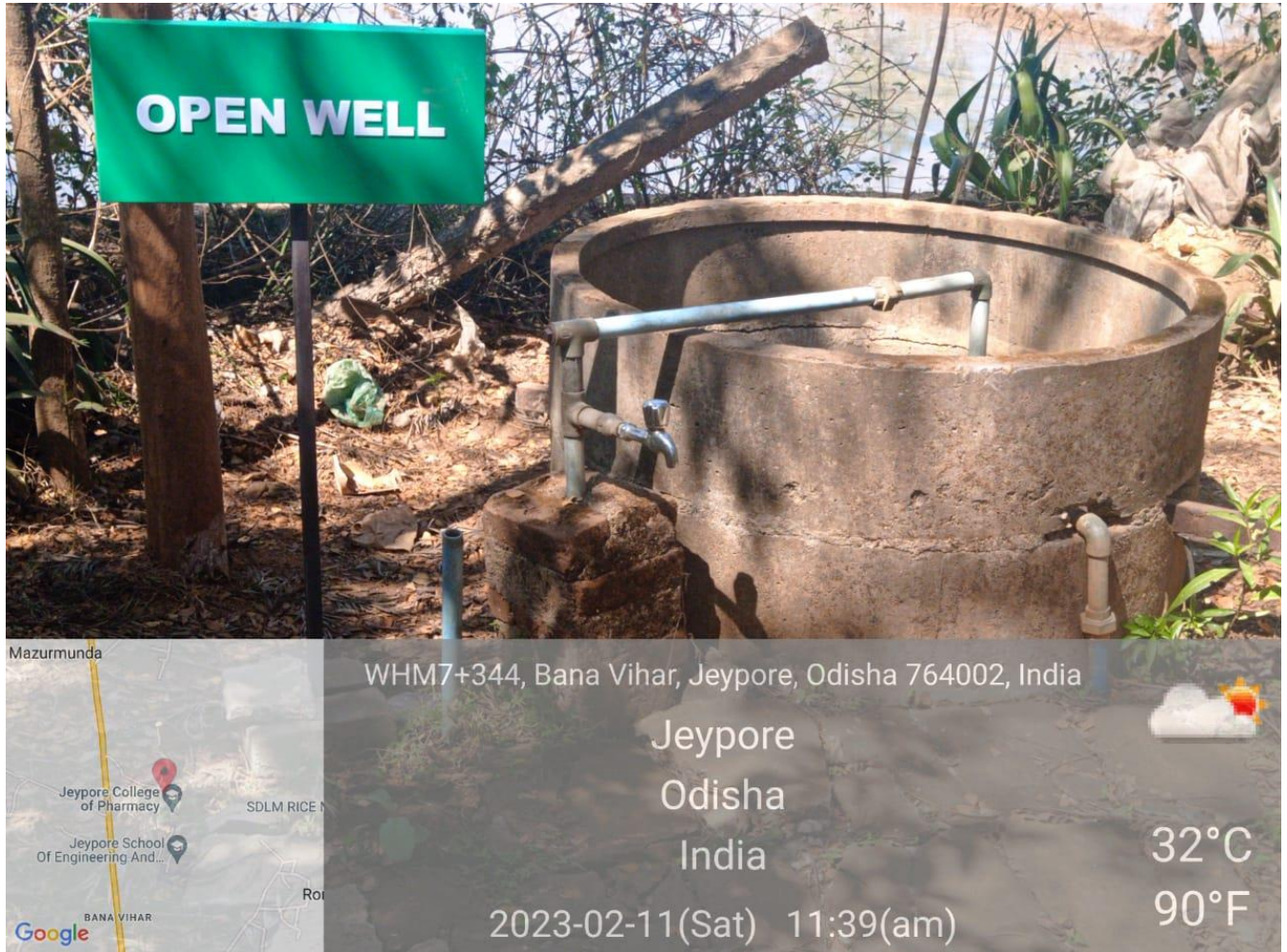
Fig-4 Open well at JCP.

PRINCIPAL JEYPORE COLLEGE OF PHARMACY RONDAPALLI, JEYPORE (K) 764002