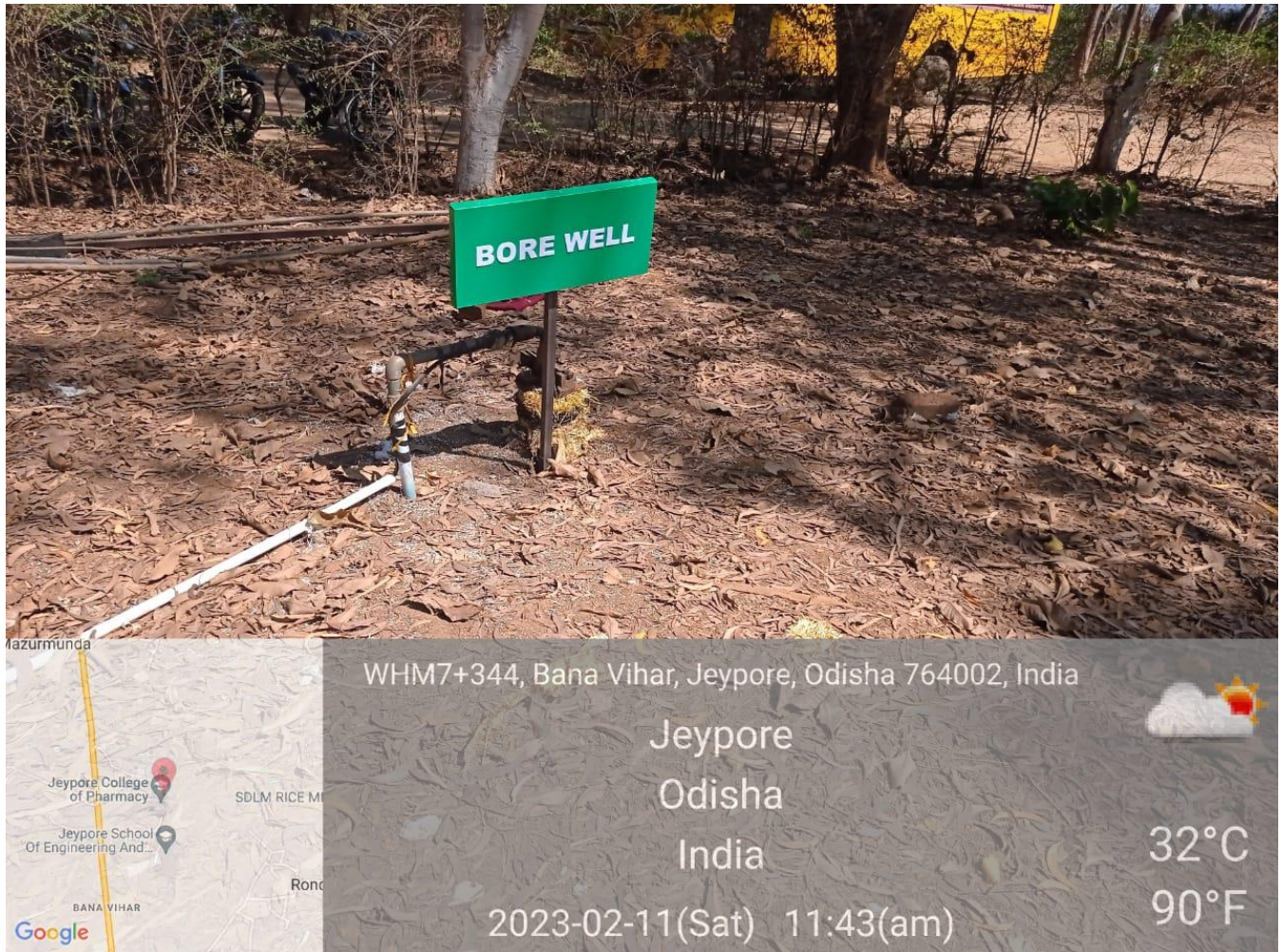
Fig-5 Bore well at JCP.

PRINCIPAL JEYPORE COLLEGE OF PHARMACY RONDAPALLI, JEYPORE (K) 764002