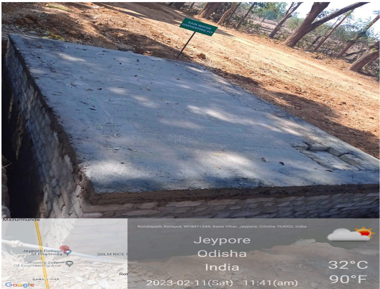
Fig-1 Rain water harvesting Pit.

PRINCIPAL JEYPORE COLLEGE OF PHARMACY RONDAPALLI, JEYPORE (K) 764002