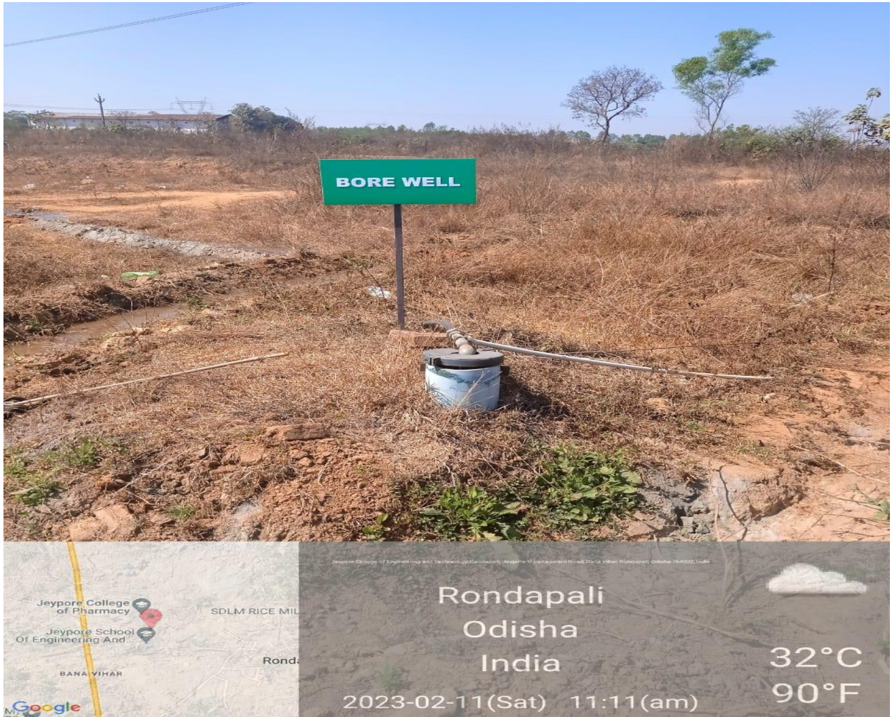
Fig-6 Bore well at JCP.

PRINCIPAL JEYPORE COLLEGE OF PHARMACY RONDAPALLI, JEYPORE (K) 764002