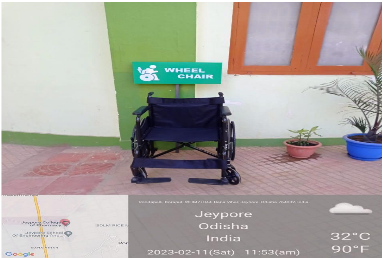
Fig-3 Wheel Chair for Special able persons.

PRINCIPAL JEYPORE COLLEGE OF PHARMACY RONDAPALLI, JEYPORE (K) 764002