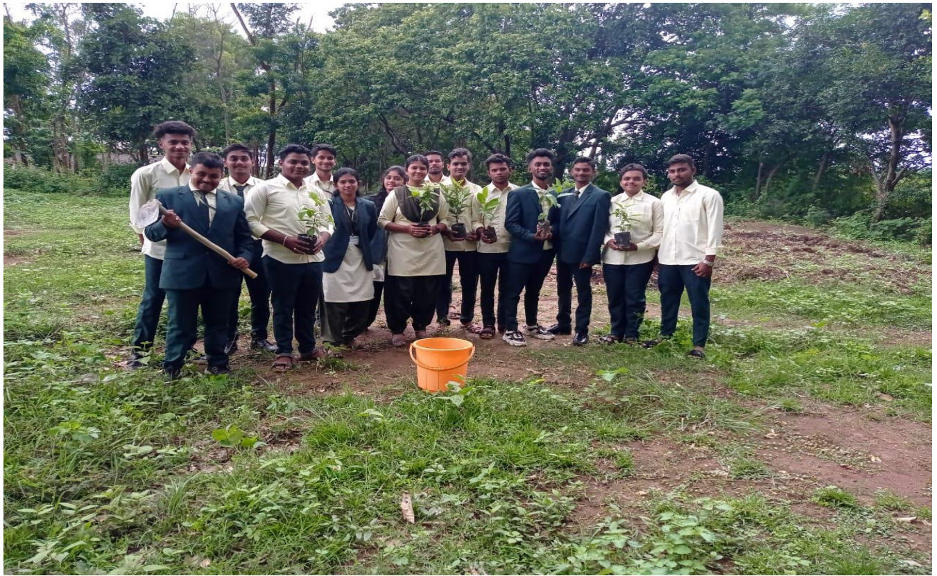
Fig-5 Students with Sampling.

PRINCIPAL JEYPORE COLLEGE OF PHARMACY RONDAPALLI, JEYPORE (K) 764002