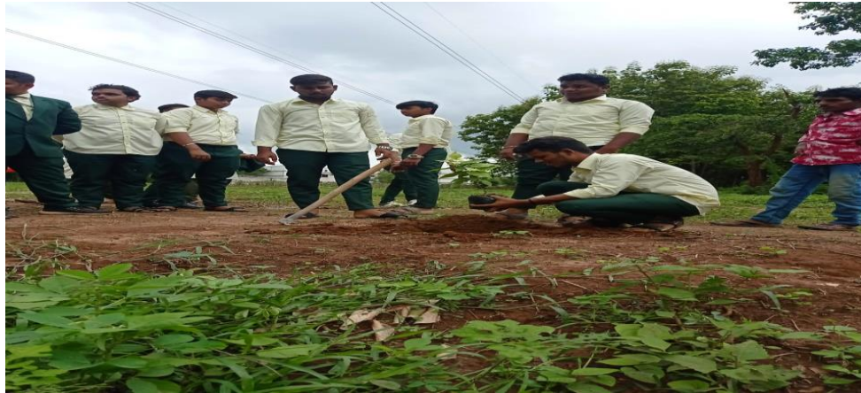
Fig-2 Students Doing Plantation.