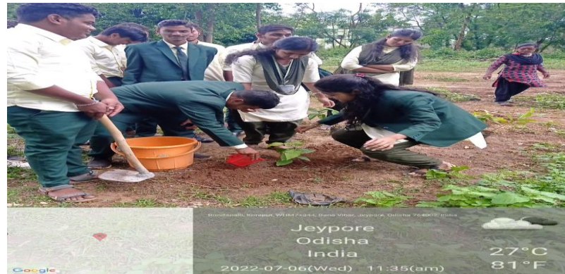
Fig-6 Students doing Plantation.

PRINCIPAL JEYPORE COLLEGE OF PHARMACY RONDAPALLI, JEYPORE (K) 764002