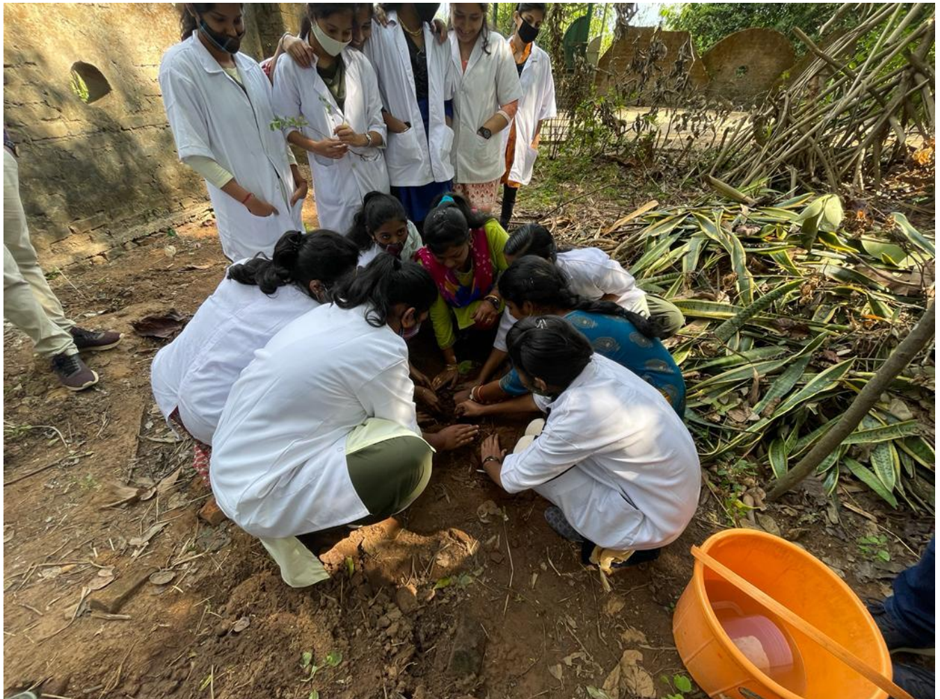
Fig-4 Students doing plantation.

PRINCIPAL JEYPORE COLLEGE OF PHARMACY RONDAPALLI, JEYPORE (K) 764002