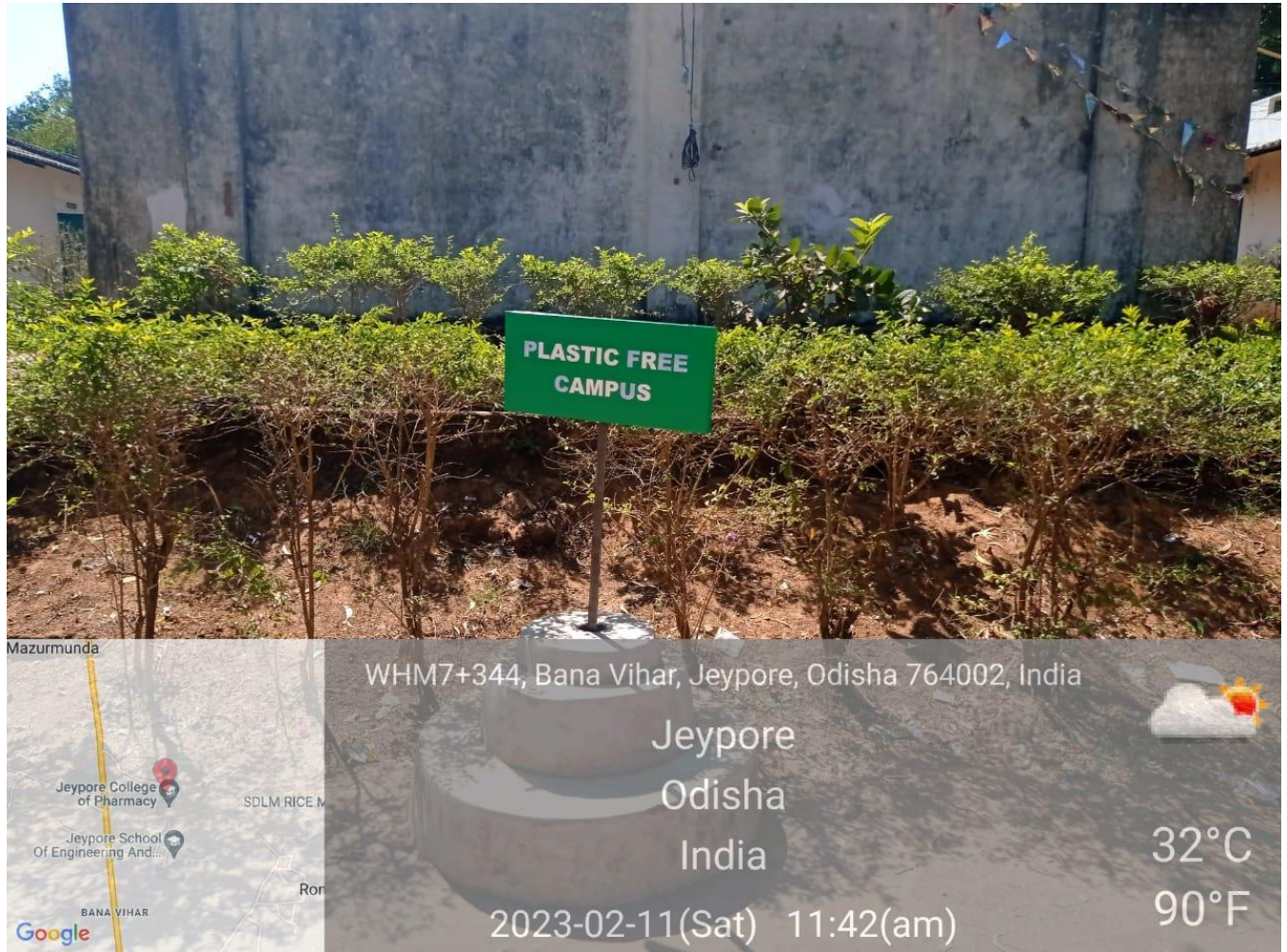
Fig-7 Plastic free Campus.

PRINCIPAL JEYPORE COLLEGE OF PHARMACY RONDAPALLI, JEYPORE (K) 764002