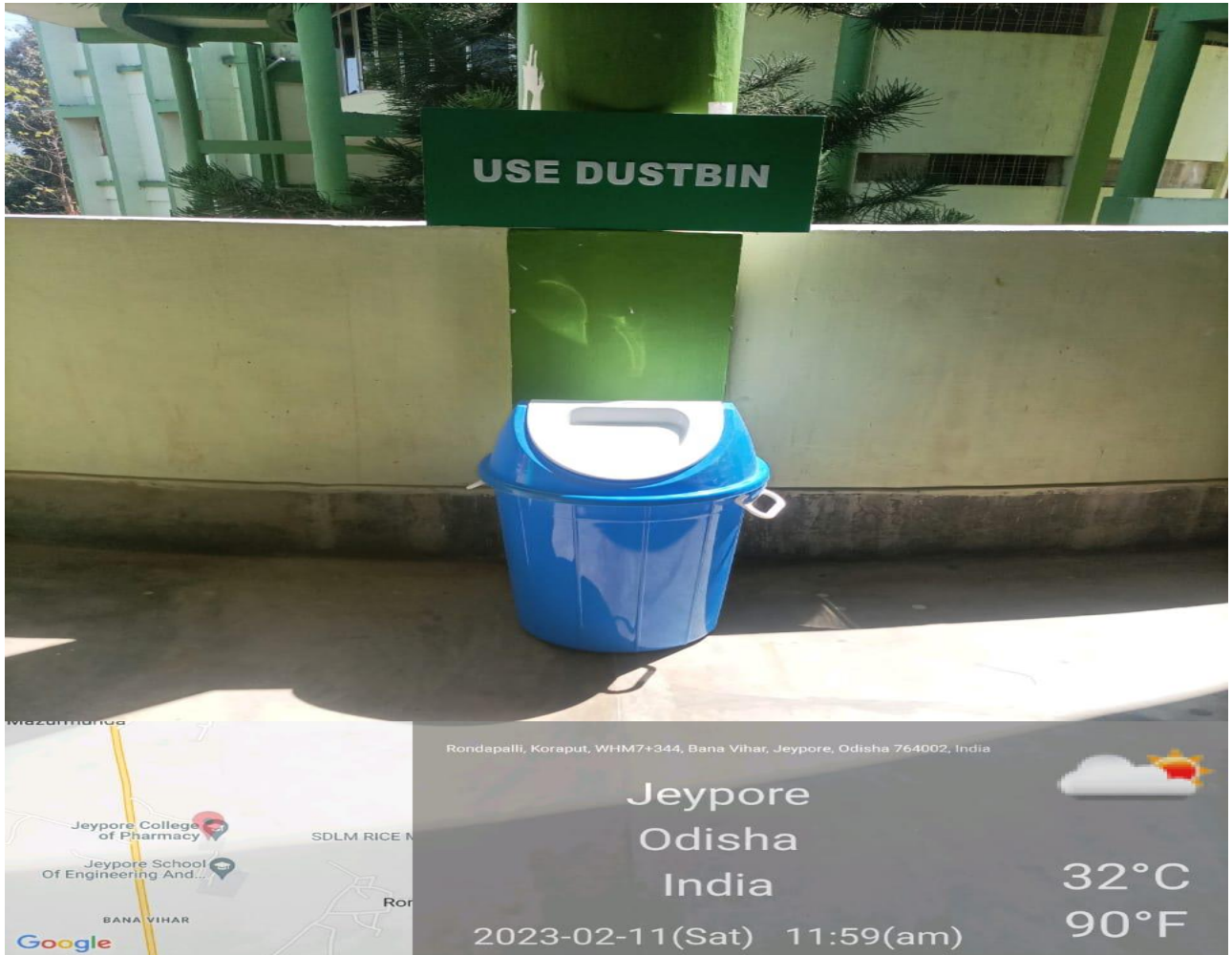
Fig-11 Use of Dustbin

PRINCIPAL JEYPORE COLLEGE OF PHARMACY RONDAPALLI, JEYPORE (K) 764002