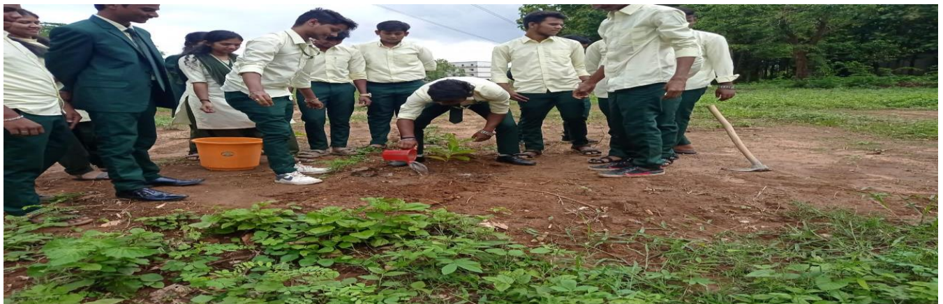
Fig-3 Plantation at JCP.

PRINCIPAL JEYPORE COLLEGE OF PHARMACY RONDAPALLI, JEYPORE (K) 764002