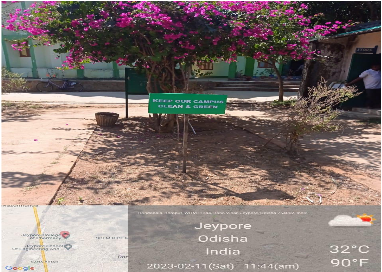
Fig-10 Green Quotes

PRINCIPAL JEYPORE COLLEGE OF PHARMACY RONDAPALLI, JEYPORE (K) 764002