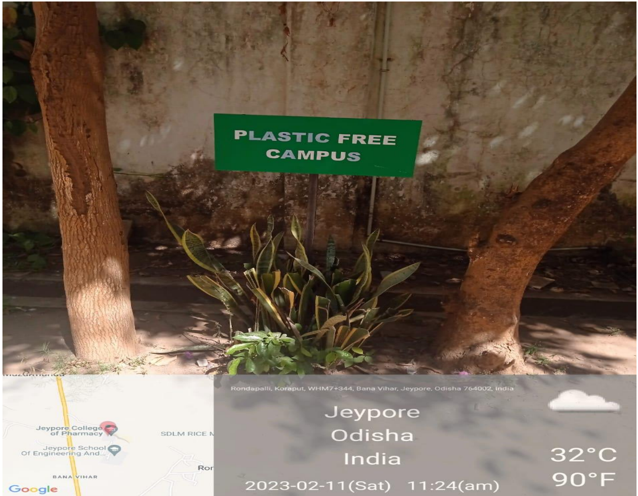
Fig-8 Plastic free Campus

PRINCIPAL JEYPORE COLLEGE OF PHARMACY RONDAPALLI, JEYPORE (K) 764002