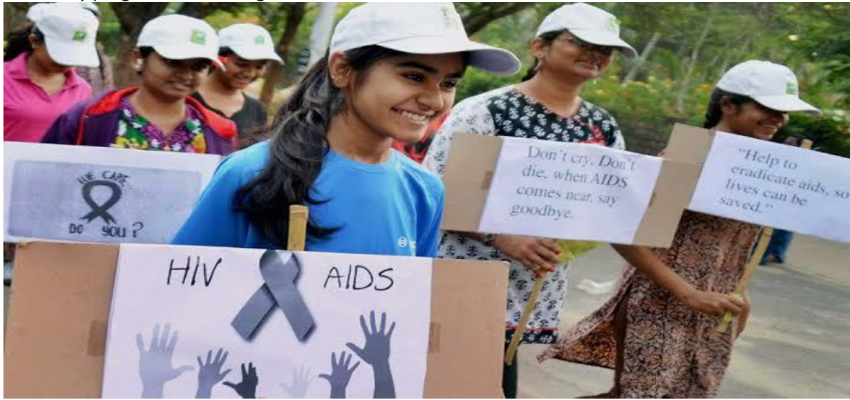
Fig-1 Rally on Aids Day.

World AIDS Day falls on December 1 each year. World AIDS Day is dedicated to spreading awareness of the AIDS pandemic spread by the spread of HIV infection, and to mourning those who have died of the disease. An estimated 40 million people worldwide have died of AIDS since 1981, and an estimated 37 million are living with HIV, making it one of the most important global public health issues in recorded history. Despite recent improvements in treatment, the AIDS epidemic still claims an estimated two million lives each year, of which more than 250,000 are children. On this day Jeypore college of pharmacy took the initiative steps of spreading awareness about the HIV infection among the people , students were ask to prepare poster presentation about the quotation of HIV awareness. And a rally programmer was organized.