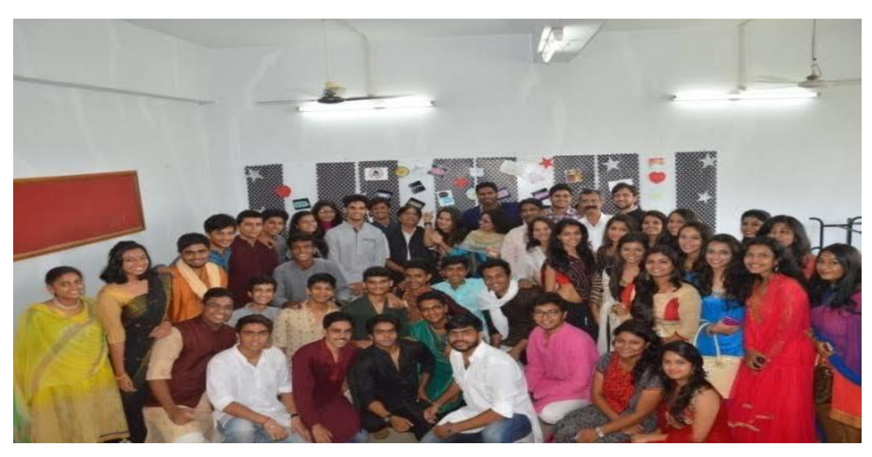
Fig-1 Celebration of Teachers Day

Teachers truly are the backbone of society. They are role models for children, offer guidance and dedication and give young people the power of education. Because of teachers, countries are able to further develop socially and economically. 1) Assessor 2) Learning mediator 3) Interpreter and designer of learning programmes and materials4) Leader, administrator and manager 5) Scholar, researcher and lifelong learner 6) Community, citizenship and pastoral role7) Learning area/subject/discipline/phase specialist1.2demonstrate these roles in your classroom. As like every year this year also students of Jeypore College of Pharmacy organized an entertaining program for the teachers. All the staff members enjoyed and also some games were arranged for the teachers like musical chairs and a cake cutting program was observed. They really made our day.