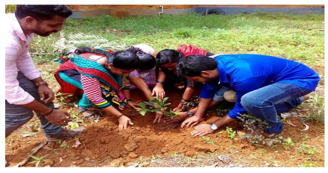
Fig-1 Plantation of tree in World Environment Day.

The theme for 2018, "Beat Plastic Pollution," is a call to action for all of us to come together to combat one of the great environmental challenges of our time. The theme invites us all to consider how we can make changes in our everyday lives to reduce the heavy burden of plastic pollution on our natural places, our wildlife – and our own health.All year long, in Biosphere Reserves around the world, communities are developing local solutions to improve the relationship between people and their environments ,Swatch Bharat campaign was organized by our Jeypore college of pharmacy staff along with students went to a nearby village i.e. "Rondapalli" for cleaning the surroundings and making it a clean area. After the campaign plantation was held in the college campus after that biscuits packets were distributed among the students, the students also became happy for that. The activity concluded at around 11.00AM and everybody returned back to their work.