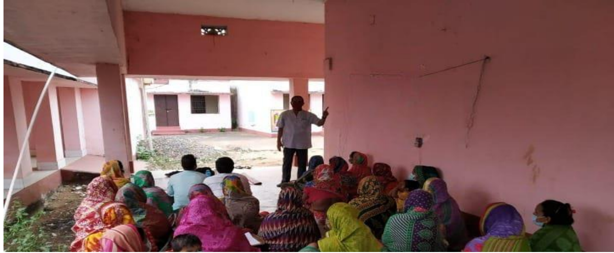
Fig.1 Leprosy Awareness to the community of Rondapalli.

Globally, iodine deficiency disorders have become a public health problem. Nearly, onethird of the world's population is at the risk of developing iodine deficiency disorders, and according to the World Health Organization (WHO), about 54 countries are still iodine deficient. On the occasion of this day Jeypore college of pharmacy took the initiative steps for the students along with the villagers of Rondapalli by giving prevention steps about deficiency of iodine and intake of iodine rich food.