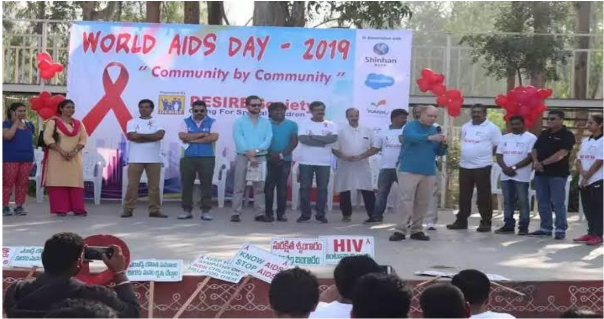
Fig.1-Awareness Program Regarding AIDS.

World AIDS Day falls on December 1 each year. World AIDS Day is dedicated to spreading awareness of the AIDS pandemic spread by the spread of HIV infection, and to mourning those who have died of the disease. An estimated 40 million people worldwide have died of AIDS since 1981, and an estimated 37 million are living with HIV, making it one of the most important global public health issues in recorded history. On this day Jeypore college of pharmacy took the initiative steps of spreading awareness about the HIV infection among the people , students were ask to prepare poster presentation about the quotation of HIV awareness. And a rally programmer was organized at Jeypore town from medical to Raja Nagar Chowk.