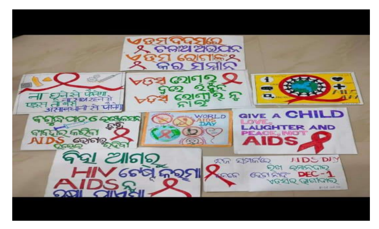
Fig-1 Awareness posters made by our ug and pg students.

Jeypore college of Pharmacy observed World Aids Day on Dec 1 with the Theme "End inequalities. End Aids". By observing this day it gives us an ability to fight against the spread of HIV. An Awareness Programme is conducted by our M.pharm students and B.ph students at JCP campus by presenting poster. where 9 no of posters are drawn by our students for creating the sensitization about preventative methods to stop the spread of HIV.