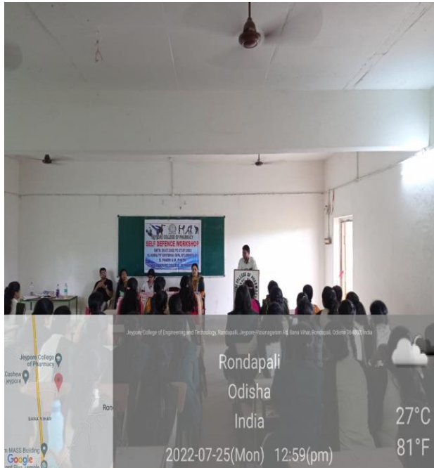
Fig-1 Self defence training meeting