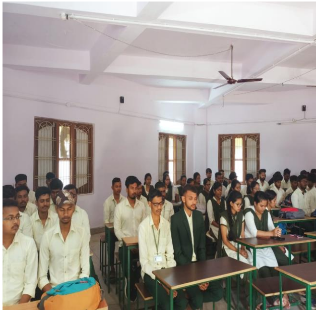
Fig-1 Students doing Meditation.