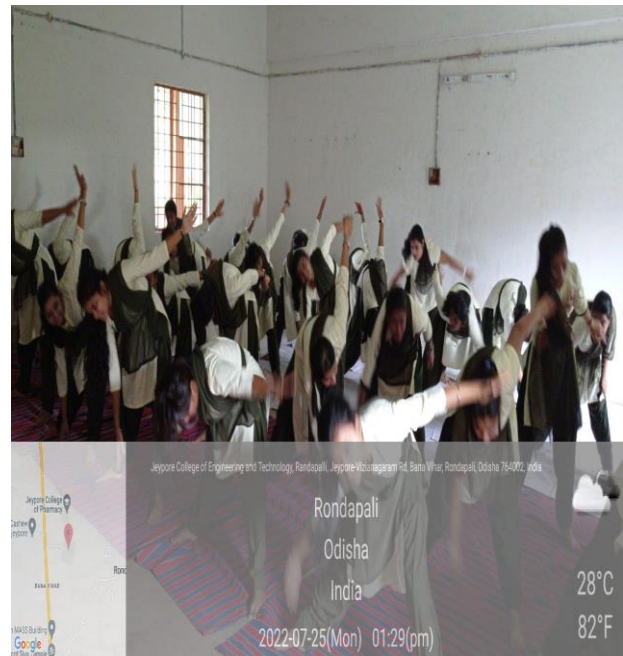
Fig-2 Activity on Self defence training

PRINCIPAL JEYPORE COLLEGE OF PHARMACY RONDAPALLI, JEYPORE (K) 764002