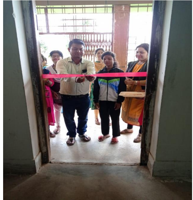
Fig-2 Ribbon Cutting by Vice Principal Sir

PRINCIPAL JEYPORE COLLEGE OF PHARMACY RONDAPALLI, JEYPORE (K) 764002