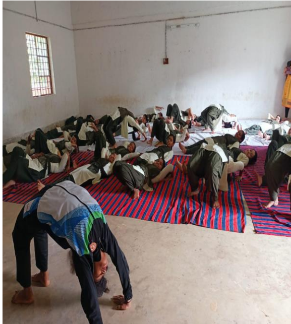
Fig-1 Students Performing self defense.