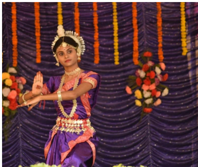
Fig-1 Odishi performance by student.