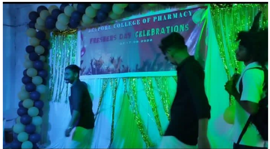
Fig-4 Performance by Students

PRINCIPAL JEYPORE COLLEGE OF PHARMACY RONDAPALLI, JEYPORE (K) 764002