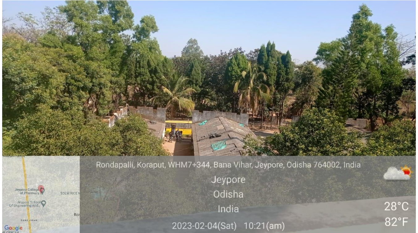
Fig-2 Campus of JCP

PRINCIPAL JEYPORE COLLEGE OF PHARMACY RONDAPALLI, JEYPORE (K) 764002