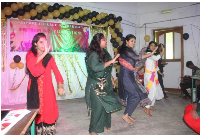
Fig-2 Dance by students