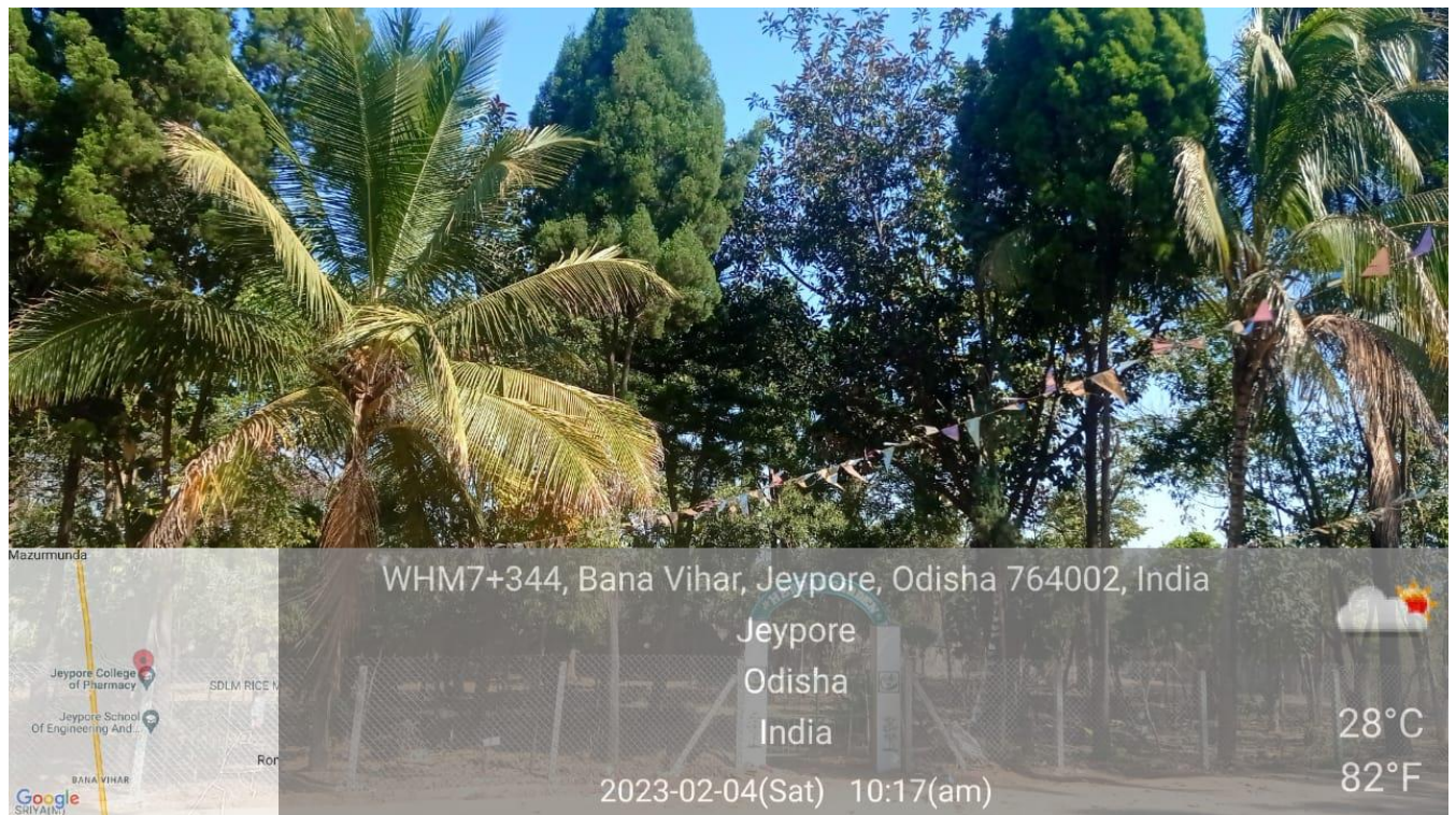
Fig-1 Green JCP

PRINCIPAL JEYPORE COLLEGE OF PHARMACY RONDAPALLI, JEYPORE (K) 764002