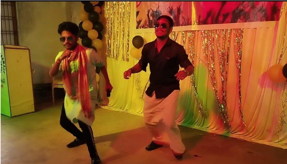
Fig-3 Performance by Students