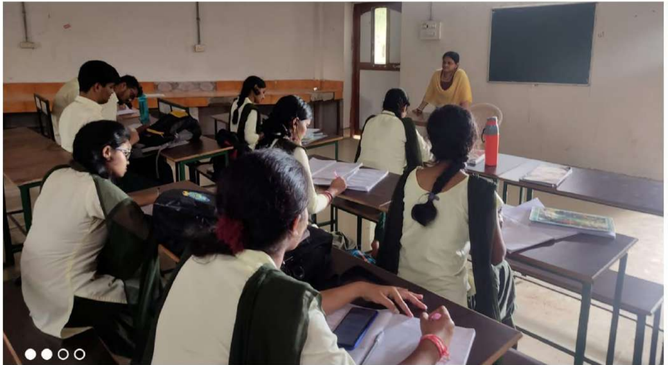
Photo: One day Workshop on “Research Report Writing and Plagiarism”