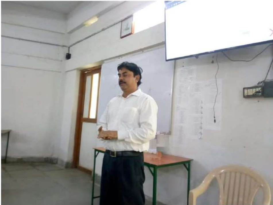
Photo: Workshop on New Drug Application

Report: - The program “New Drug Application “