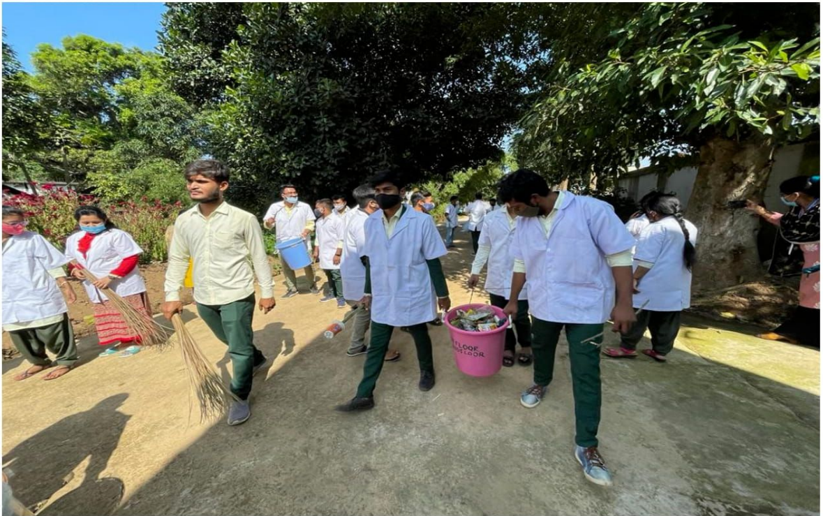
Pic.1-Swatch Bharat Abhiyan Program on Gandhi jayanti.

Jeypore College of Pharmacy has celebrated “ Gandhi Jayanti ” on 2nd October 2018 . A swatch Bharat Campaign was organized on this day. Students of JCP along with staff went to rondapali village to make the village clean & green after the program snacks program was arranged for the students those who participated around 50 students in this campaign. Remembering Mahatma on his 149 st birth anniversary, worldwide celebrated as the “International Day of Nonviolence”. The man who showed the world that nonviolence is an effective and lasting way of defeating injustice. He is a great inspiration of truly embodying the principles of tolerance and peace. In his words “You must be the change you wish to see in the world”. May the spirit of truth and non-violence be with us forever? Date of the Event: 02-10-2018 Name of the Event: Celebrations on Gandhi Jayanthi (Swatch Bharat Campaign) Venue: Ambaguda village. Number of Students Participated: 15