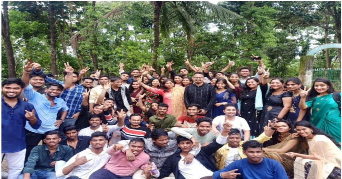
Pic Students Celebrating Youth Day.

Rondapalli, Jeypore, Dist. Koraput-764 002, Odisha