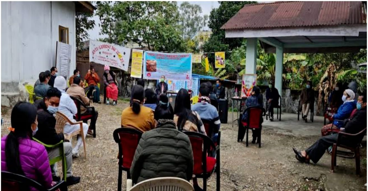
Pic Leprosy Awareness to the community.

Rondapalli, Jeypore, Dist. Koraput-764 002, Odisha