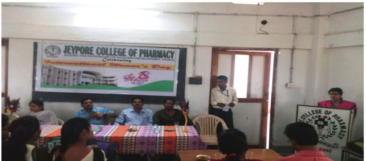
Pic-Womens Day Celebration.