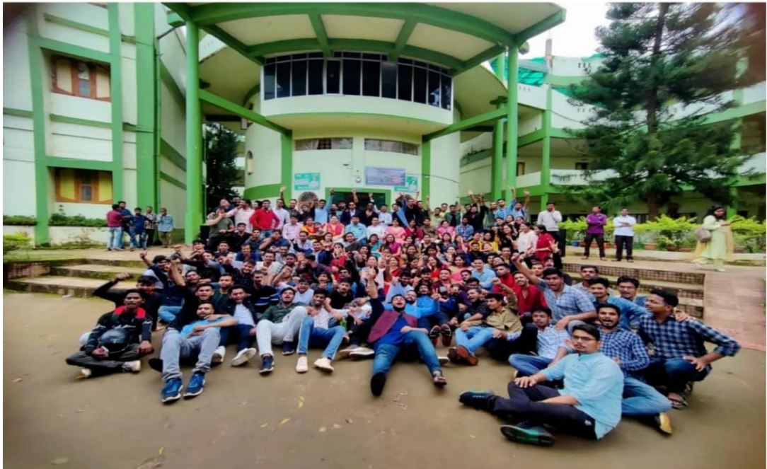
Pic.1-Celebration of youth Day.