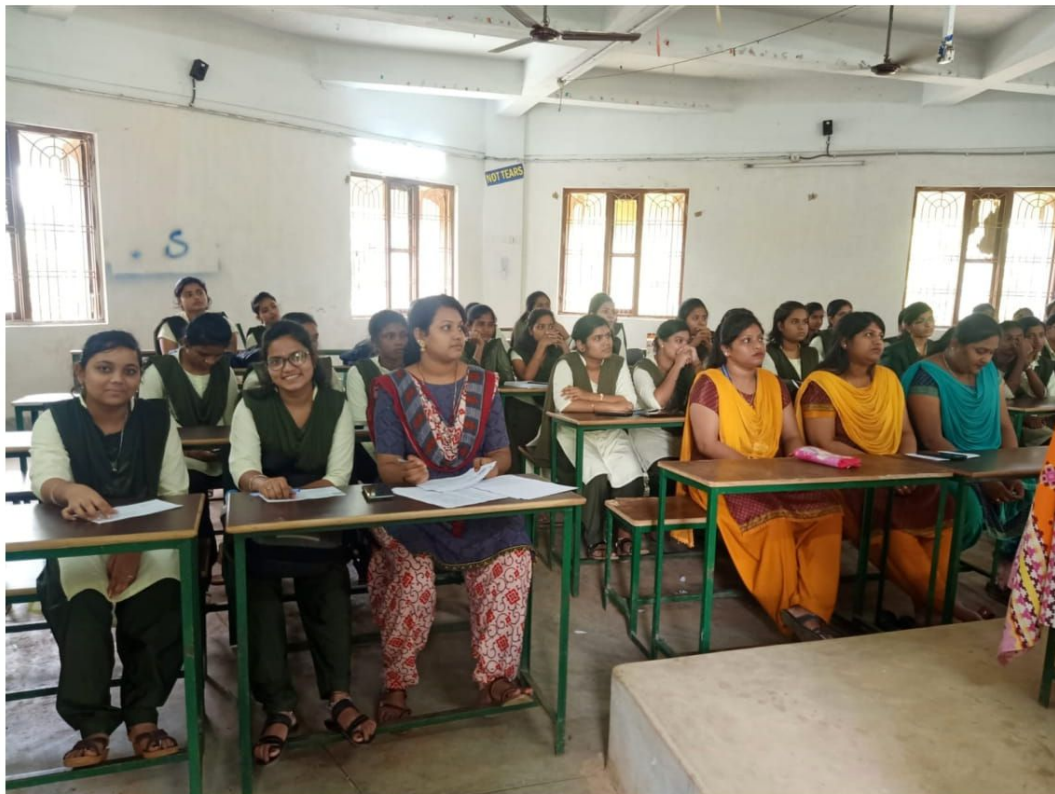
Pic.1-Speech on Gender Equality.

PRINCIPAL JEYPORE COLLEGE OF PHARMACY RONDAPALLI, JEYPORE (IN) 754002