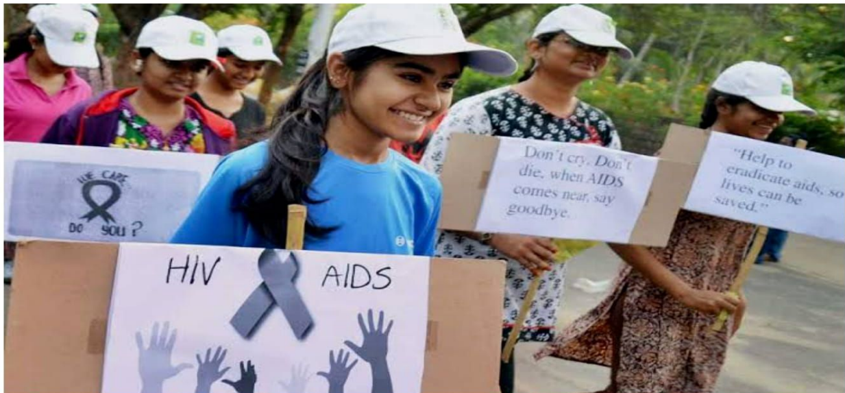
Pic.1- Awareness Rally On AIDS Day.