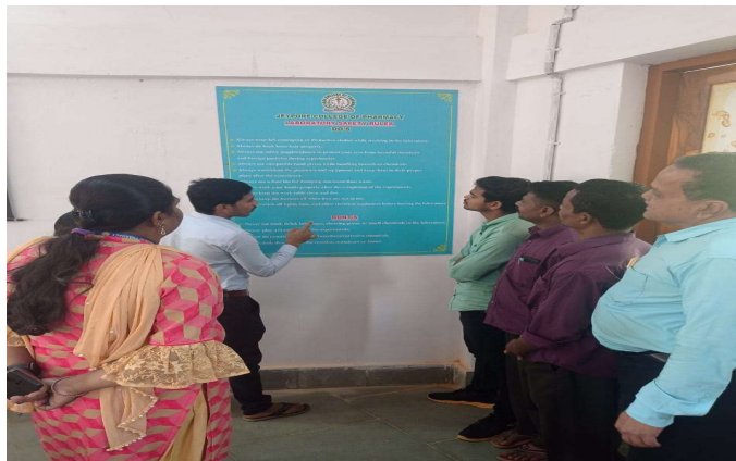
Fig:1. Evaluation of learning object by the demonstrater

A training Programme titled “Lab safety” Was conducted by Jeypore College of Pharmacy dated 14.12.2020 to 15.12.2020. The training program was aimed at demonstrating “Lab safety”. It is very important to emphasize that safety is about learning how to carry out laboratory work safely and not only about rules and regulations, so students are required to think about responsibility for safety in the conduct of their work. Working safely is a basic responsibility of every employee and every student. Reduce unnecessary risks, ensure that regulations are followed by others, and always bring safety concerns to the attention of a supervisor. The Lab Attender and Lab- Assistant staff members expressed that the programme highly helped them. A total of 05 nos. of The Lab Attender and Lab- Assistant staff members participated in the programme.