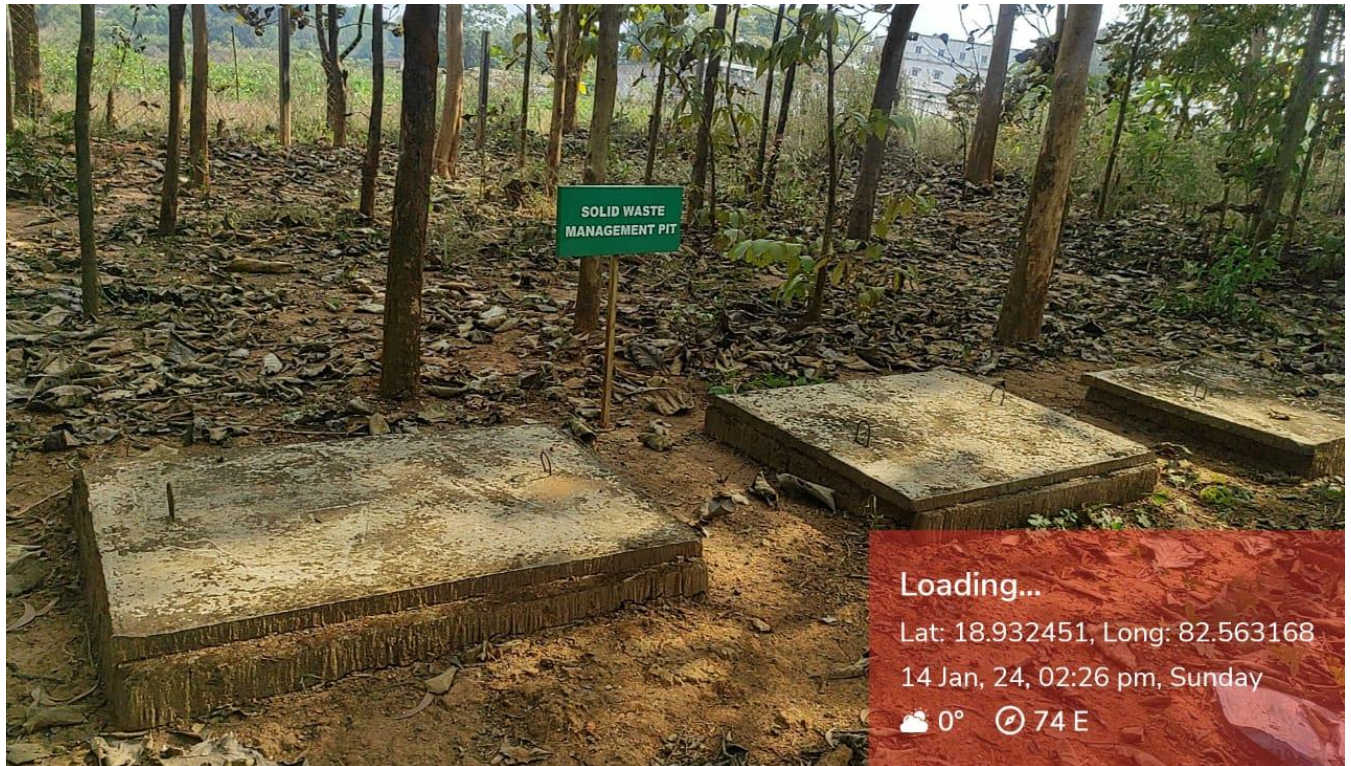
FIG-1 SOLID WASTE MANAGEMENT