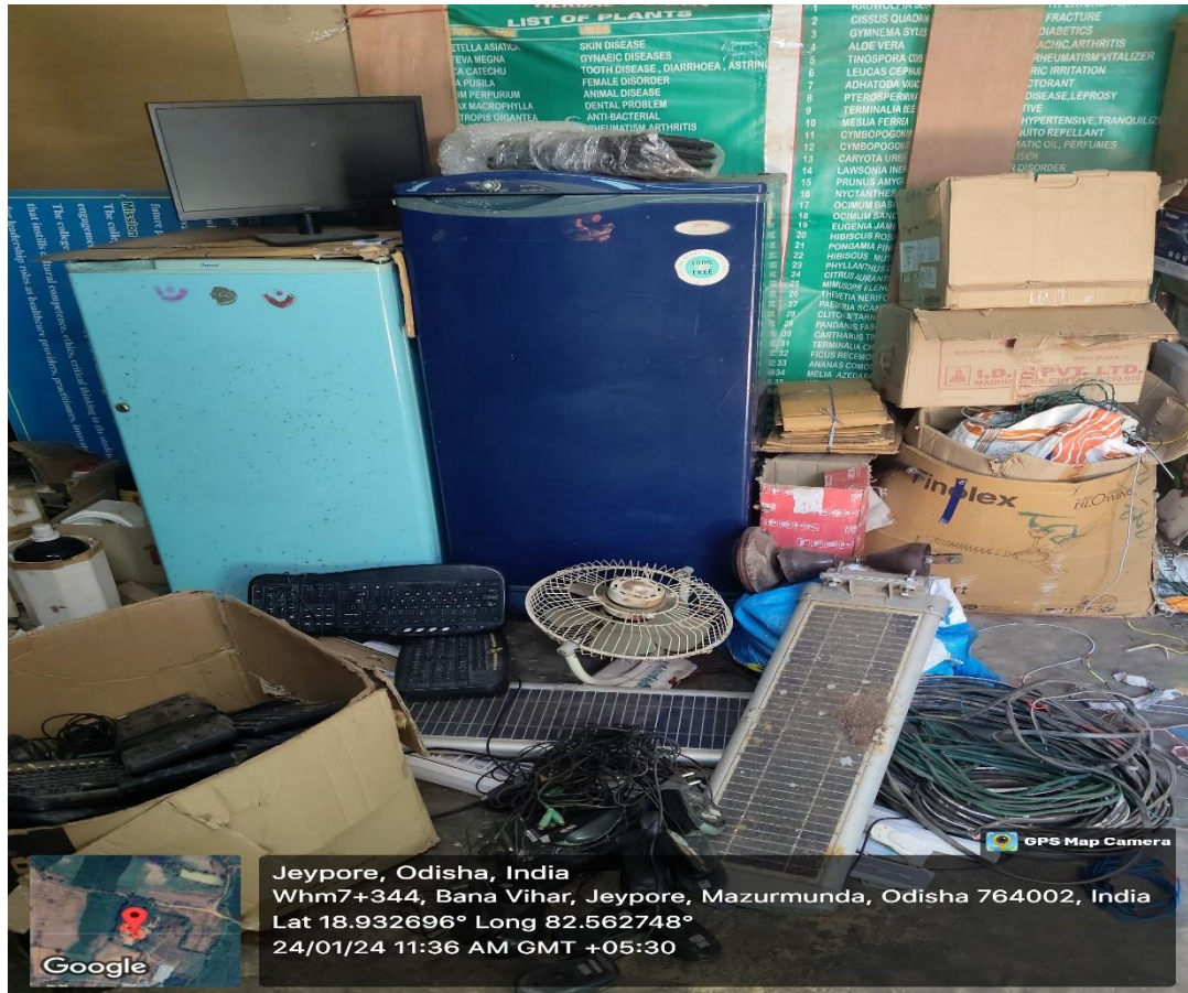
Fig-2 E waste collecting room