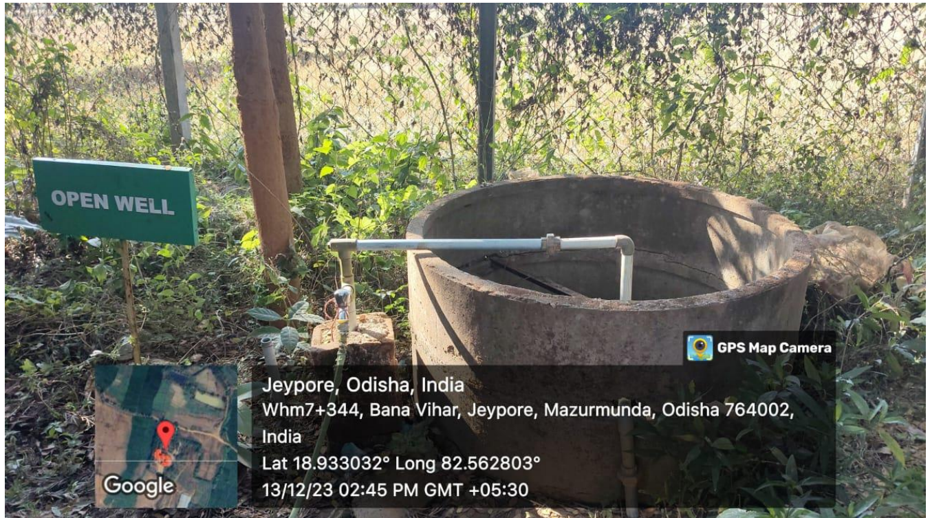
FIG-3 OPEN WELL