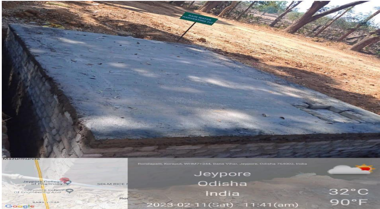
FIG-1 RAIN WATER HARVESTING AREA