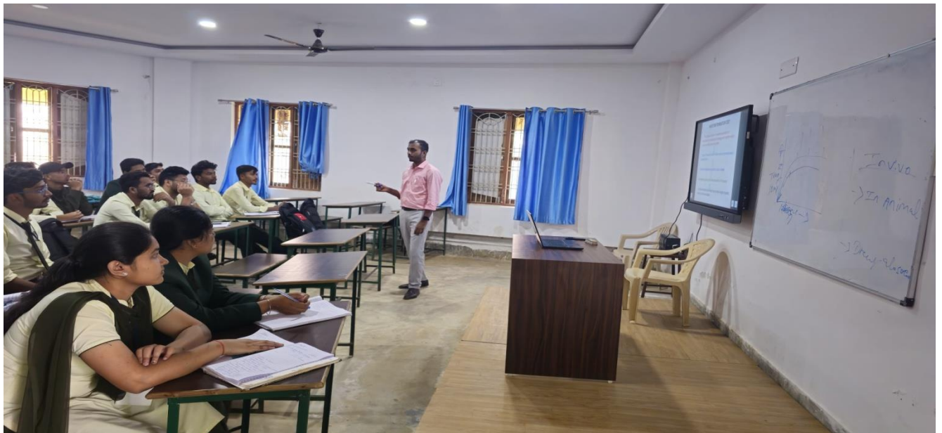
PIC-5: Teachers using ICT Tools in Class.