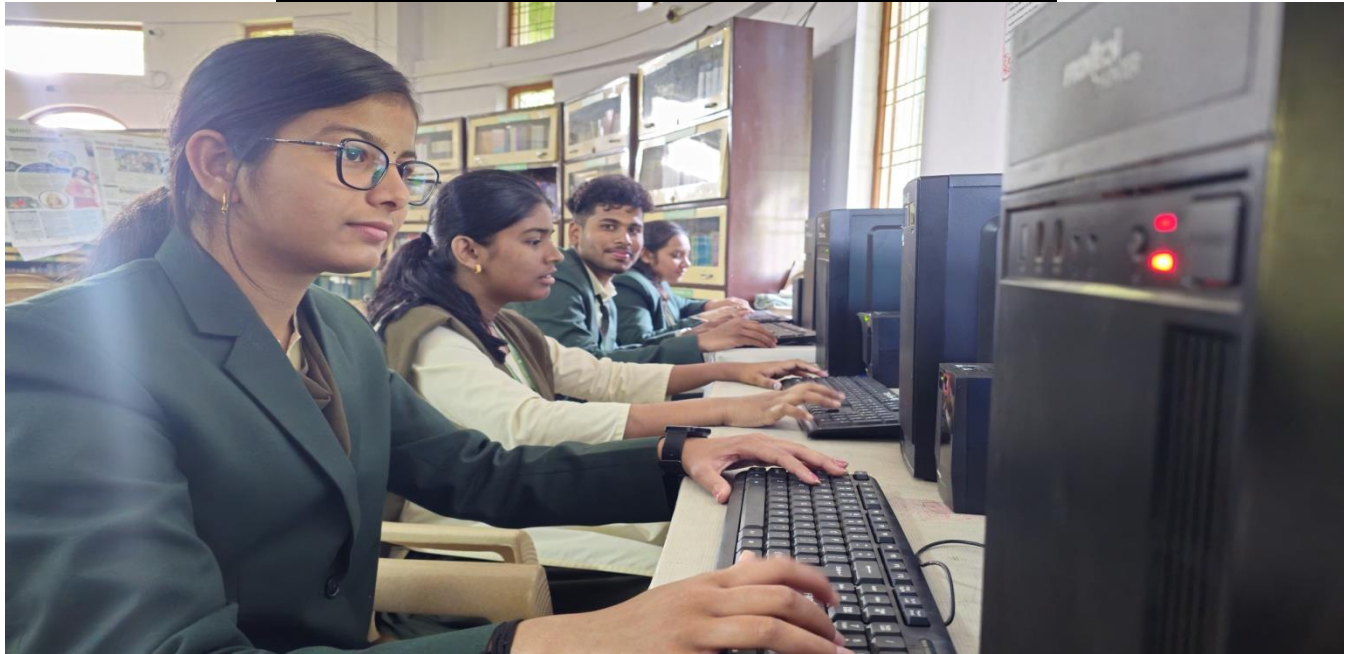
PIC-1:Facilities for Students With e-learning Process.