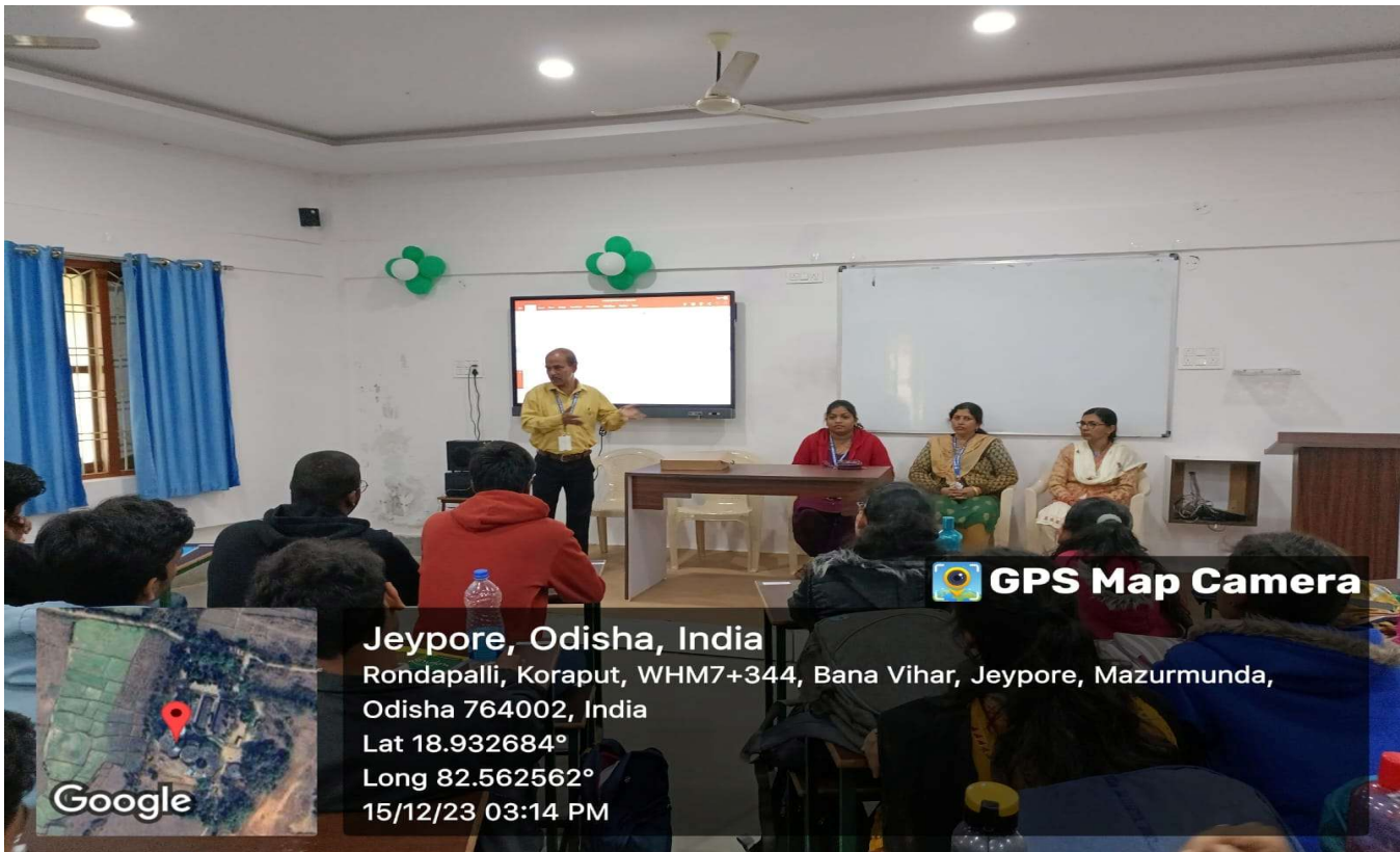
Fig:1. COACHING FOR COMPITATIVE EXAMINATIONS