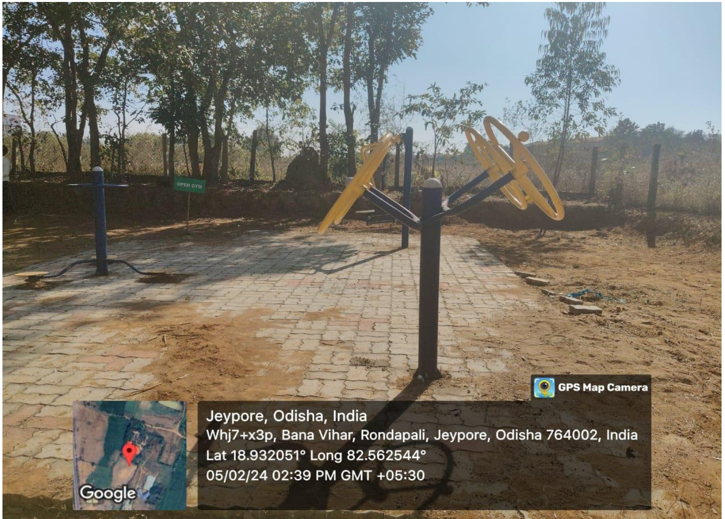
IMAGE OF GYMNASIUM